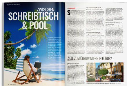
SERVICE & TESTS & TIPS

REISE & PREISE provides their readers with informative and inspirational features, up-to-date illustrated specials about various cities and countries worldwide, including exciting insight travel reports written by passionate travellers, competent service articles, plenty inside tips and much more. With this diversified content REISE & PREISE awakens dreams by providing the ideal environment for your exceptional magazine advertisement. Our REISE & PREISE magazine aims at discerning individuals travellers as well as package and business travellers, spending a lot of money on their vacations.